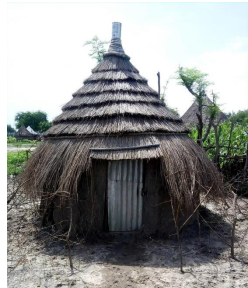
Latrine in Sudan

In a world brimming with gadgets and apps, and the ability to send people into space, 3.5 billion people STILL don't have a safe,