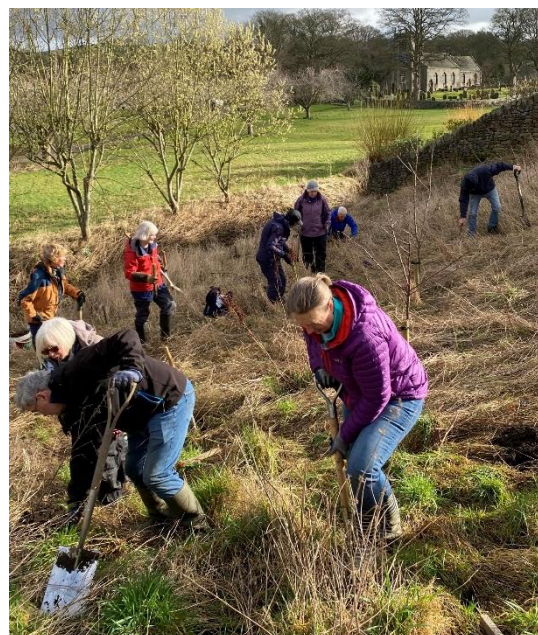
Addingham Environment Group planting a mixture of trees to help stabilize the slope and prevent undercutting of the beck bank.