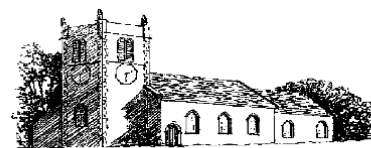
Parish Church of St Peter's Addingham LS29 0QS

To love God more deeply; to learn more about God; to live our lives more fully